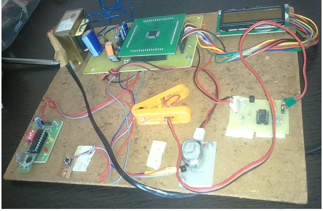
Fig. 4.1 Hardware Prototype Model